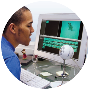
home video voiceover