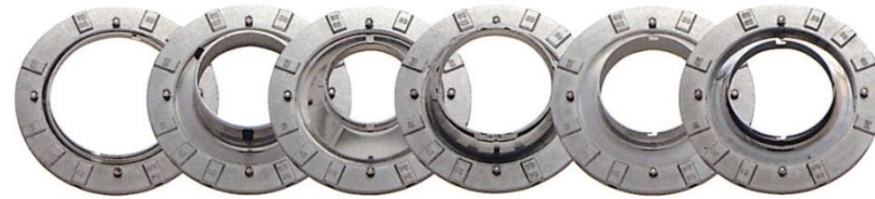
SIF-INTERFIT SMBP-MULTIBLITZ(Profilux) SNVA-NOVATRON SJL-JTL SMBV-MULTIBLITZ(Vari) SNVB-NOVATRON 2