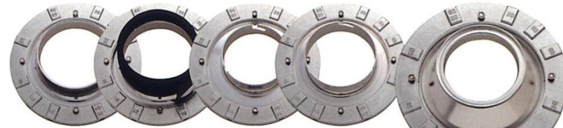
APF-Profoto(Adapter Assembly) SPPA-PROPET(A) SPF-Profoto SPPB-PROPET(B) SPG-PHOTOGENIC