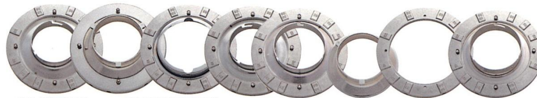
APN-PHOTONA SST-SPEEDOTRON STK-TOKINA SRO-Seeding only S16-For Grand Softbox SSS-SUNSTAR SIO-Inside ring only SNM-NORMAN