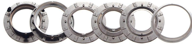
SDL-DYNLITE SEC-ELINCHROM SHSE-HENSEL(Expert) SET-ELECTRA SHR-HD/RIMELITE SHSM-HENSEL(Mono)