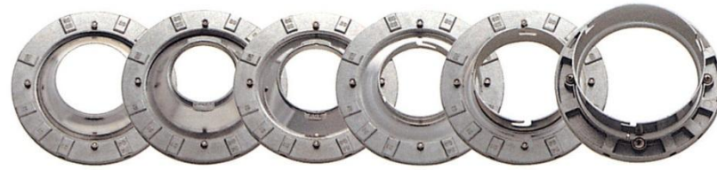
SBC-BALCAR SBCP-BRONCOLOR(Pulso) SBMB-COMET(B) SBCI-BRONCOLOR(Impact) SCMA-COMET(A) SCT-COURTNEY