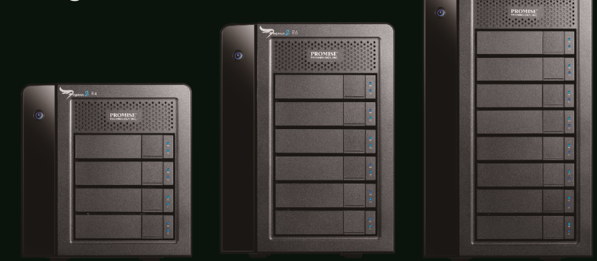
Figure 3. Pegasus2 unit front view