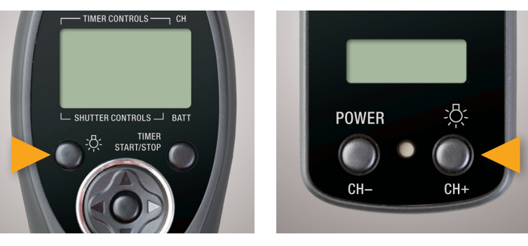
Transmitter backlight button

Both the transmitter and receiver feature a backlight for low-light shooting conditions. Press and hold the backlight button for three seconds to activate the backlight on the display. The backlight will remain lit for about six seconds on the transmitter and four seconds on the receiver.