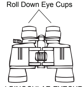
Fig.4 BINOCULAR EYECUPS

Your binocular is fitted with either rubber roll-down or rubber pop-up eyecups designed for your comfort and to exclude extraneous external light. If you wear sun/eye glasses, roll down the eyecups. This will bring your eyes closer to the binocular lens thus providing improved field of view.