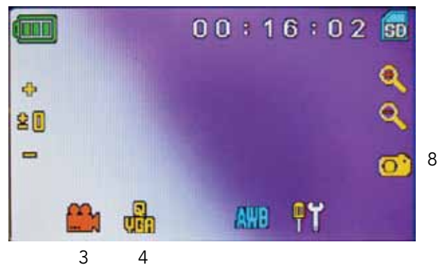
FIGURE 11 VIDEO MODE 12

Note: Do not disconnect the USB cable while transferring images or damage may occur.