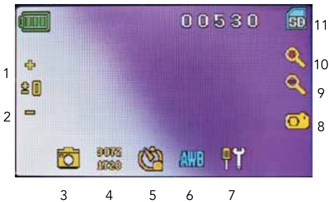
FIGURE 10 VIEWING/SNAPSHOT MODE 12

Settings and Information for the Digital Camera and the Touch Screen — The touch screen icons and their functions are quite easy to use and intuitive in nature. Below will be discussed the general use of the icons. Typically you use your fingers with the touch screen, but you can use the included touch pen as well. The touch screen has various functions and choices among those functions. From the image to the left you will find the following twelve icons/ when in the viewing/ snapshot mode!