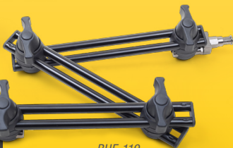
BHE-119 Three-Section Double Articulated Arm