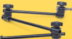
BHE-118 Three-Section Articulated Arm