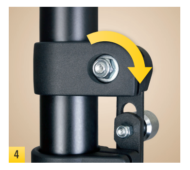
If the upper tube slips under the stress of your installation, use a socket wrench to tighten the nut at the top of the handle bracket.