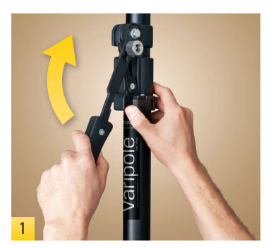
The tension that the handle delivers to the upper tube is adjustable. Release the handle's locking latch and swing the handle outwards.