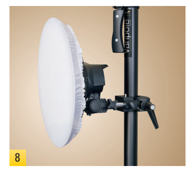
Recheck the stability of your setup after loading or removing attachments.