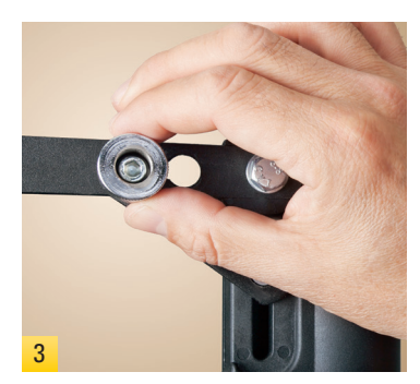
Slide the tension knob to the lower (more tension) or upper (less tension) position on the handle bracket. Retighten the tension knob and return the handle to its locked position.