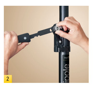
Unscrew the tension knob on the handle bracket