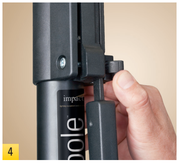
Press the locking latch outward to release the height adjustment handle.