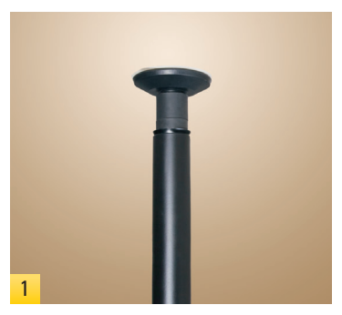
If your Varipole at its full extension will not reach the ceiling, a Varipole Extender can be used.