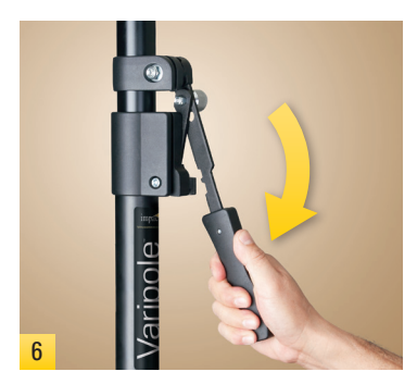
Making certain that the Varipole is vertically level, bring the handle back down until it clicks into its locking latch.