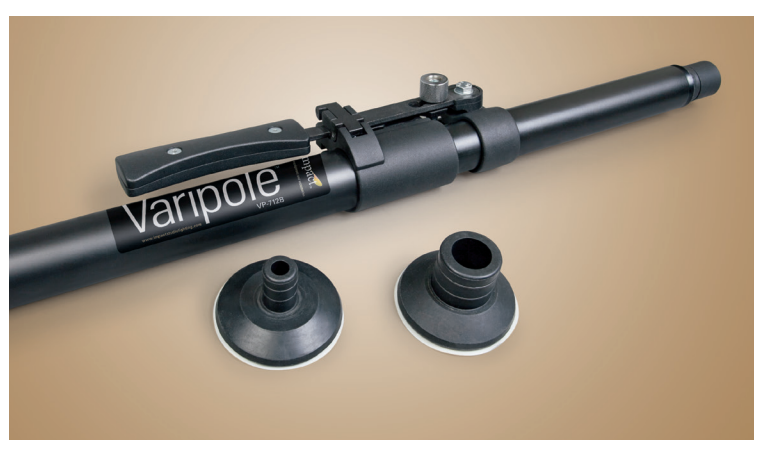
All images in this manual are for illustrative purposes only. Your Varipole system may differ slightly from the one pictured.