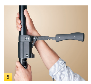
Lift the height adjustment handle. With one hand stabilizing the lower tube, lift the upper tube until it engages the ceiling.