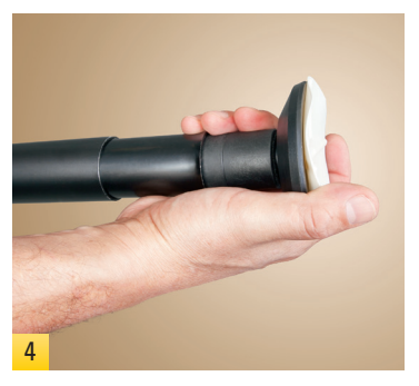
Insert the spring-loaded tube and cushion into the top of the Varipole Extender. Follow the instructions listed previously for setting up your Varipole.