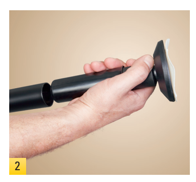
Remove the cushion and the springloaded tube from the top of the Varipole.