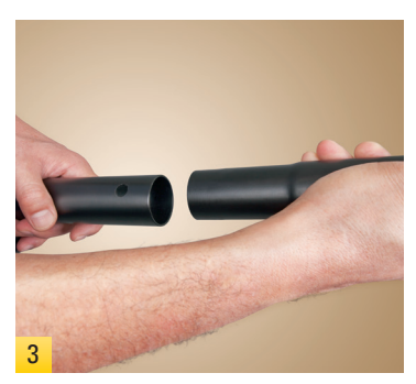
Insert the narrow end of the Varipole Extender into the top of the Varipole.