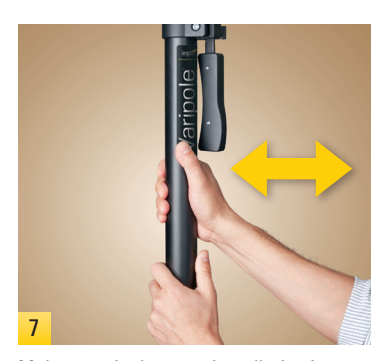
Make certain that your installation is secure by gently rocking the pole.