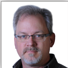
Quikbox with grid

7 Either roll or fold the grid in thirds and replace in the carry bag.