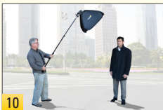
10 With strap, using both hands