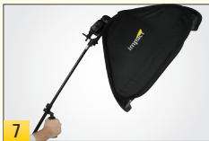
7 Using the QuikStik with the Impact Quikbox