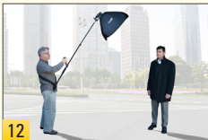
12 With strap, using one hand