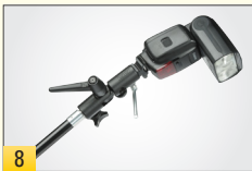
8 The QuikStik could also be used in many other configurations, such as with a standard flash bracket