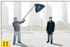
11 Without strap, using both hands