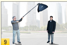
9 Without strap, using both hands