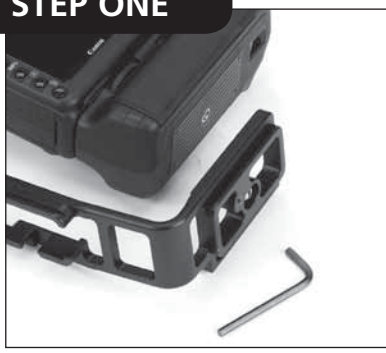
Attach L-BRACKET loosely to the bottom of the camera with ½2" ALLEN WRENCH (provided).