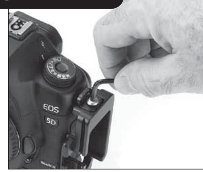
Insert the ALLEN SCREW through the CAMERA STRAP CONNECTOR and into the top of the L-BRACKET. Tighten using the ¼" ALLEN WRENCH (provided).