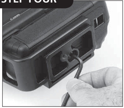
4. Tighten bottom mounting screw on the L-BRACKET WITH the ½2" ALLEN WRENCH (provided).