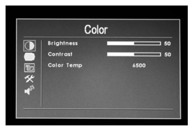
OSD in HDMI / PC Mode

After connecting power, the unit will be in standby mode, which is indicated by a red light. Press "POWER" on the unit or on the remote control, and the buttons on the unit will illuminate in blue when the unit is operational. Pressing the same button again will return the unit to STANDBY mode. Push "PC/AV" on the unit or the remote control to select the signal input.