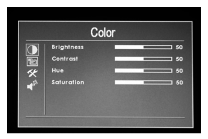
OSD in AV Mode

You can press for v on the unit or on the remote control to select the items: COLOR ADJUST MENU FUNCTION SOUND and confirm by pressing < or > on the unit or on the remote control, then push < or > again to adjust the items. Push NEW to exit the OSD after your adjustments are complete.