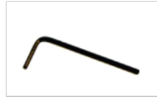
Allen Key 10-32