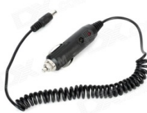
12v car adapter cable