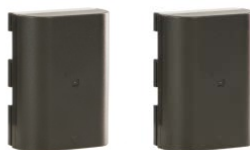
2x Batteries LP-E6