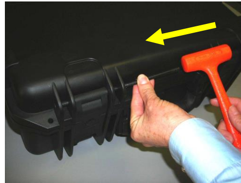
Align spare pin and tap out with hammer