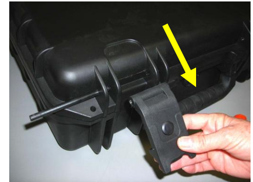
Once pin is clear of latch, actuate to remove latch