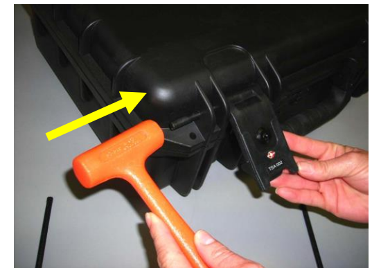
Tap pin back in place to secure latch. Actuate latch to make sure it operates smoothly