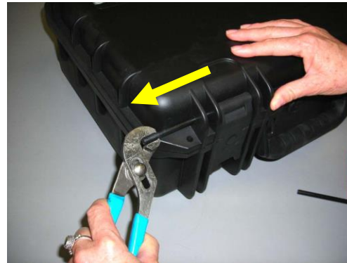
Grip pin with pliers and slide out