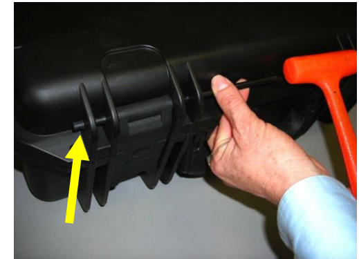
Pin is out far enough to grip with pliers