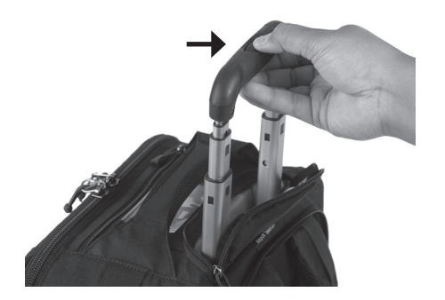
Open the zipper flap on top of the Airport TakeOff to reveal the extendable handle. To raise the handle, press and hold the button on the middle of the handle and simultaneously raise the handle completely. The release button must always be held down for the handle to be fully extended or retracted