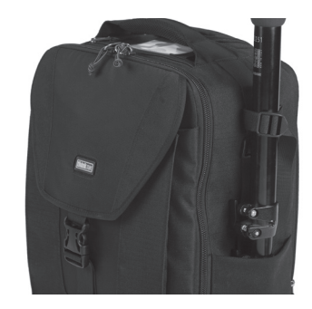
Step 5: A monopod can be carried in the stretchable side pocket and stabilized near the top of the bag with the included monopod strap.