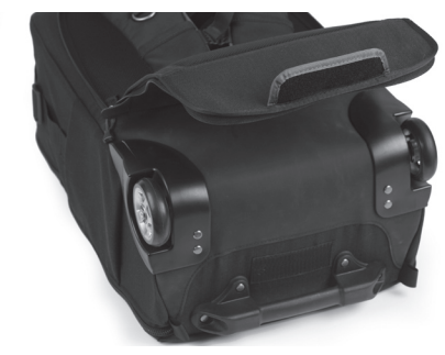
Step 2: Pull the panel down and under the wheel housings at the bottom of the bag.