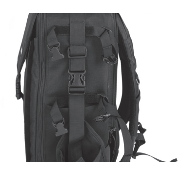
Step 2: Insert the tripod straps horizontally, above and below the triglide buckle that is fixed on the side of the Airport TakeOff. There is hook and loop on each tripod strap and the corresponding placement slot to prevent the straps from sliding out, when unclipped.