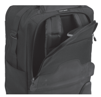
Step 1: Completely unzip the panel covering the backpack straps.