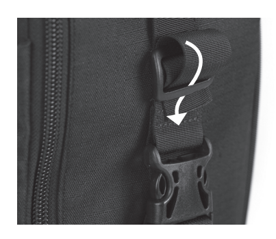
Step 4: To secure the tripod cup in place, double over the loose end of the strap and insert it into the bottom side of the triglide.