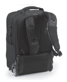
Step 4: Untuck the backpack straps from the pocket and adjust as needed for proper fit. Reinsert the backpack straps into the pocket to use the backpack as a rolling bag. Closing the covering panel is not necessary. The Airport TakeOff can still be effectively used as a rolling bag while the panel is open.