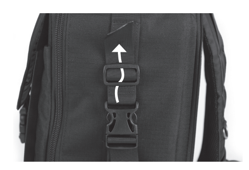
Step 3: The tripod cup attaches to the fixed triglide buckle on the side of the Airport TakeOff. Thread the open end of the tripod cup strap, up through the triglide.