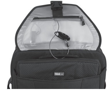
The cable and lock are inside the clear pocket, underneath the front flap on the Airport TakeOff. They are used to secure an optional laptop slip case, such as the Artificial Intelligence 15 or 17, when it is stored in the front pocket.