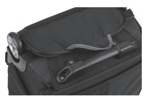
Step 3: Tightly seal the panel in place with the hook and loop, just behind the foot stand underneath the bag.