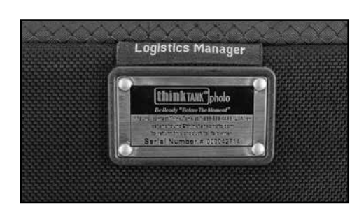
The security ID plate located on the back may be registered at:

www.thinktankphoto.com/lostandfound registration.aspx