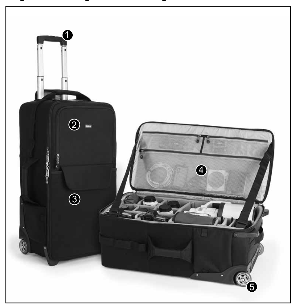
1. Hide-away top handle with easy accessibility and maneuverability; 2. Top pocket contains many organizational options for managing small items.