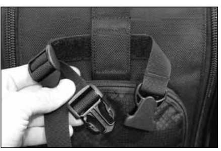
Step 1: Place the Tripod Strap under the webbing on the side of the bag, matching the hook and loop material to keep the strap in position.