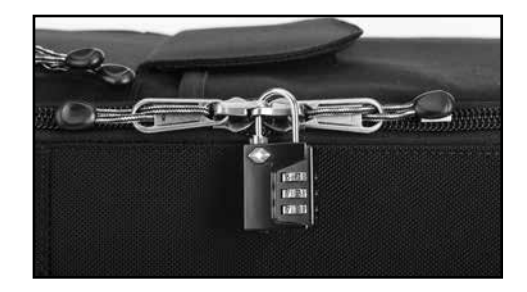
TSA combination lock to secure zipper. There are many instances when photographers must leave behind some or all of their gear. It is absolutely vital that this gear be secured from theft.