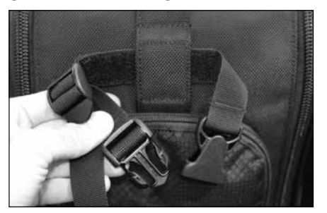
Step 1: Place the Tripod Strap under the webbing on the side of the bag, matching the hook and loop material to keep the strap in position.