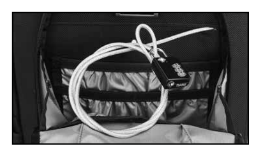
Security cable and combination lock can be used to secure zipper and lock it to immovable objects.

www.thinktankphoto.com/lostandfound registration.aspx