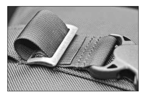
Step 2: Weave the webbing on the tripod cup through the buckle on the side of the bag as shown. It's important to back-loop the strap through the buckle to prevent the strap from loosening with usage. Airport Security V2.0 owners will find this buckle on the inside of the side zippered pocket.