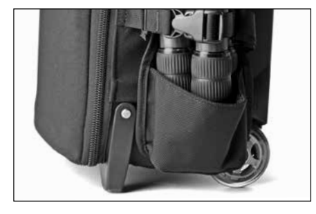
Step 3: Adjust the length of the strap so that the Tripod Cup has adequate clearance from the ground.