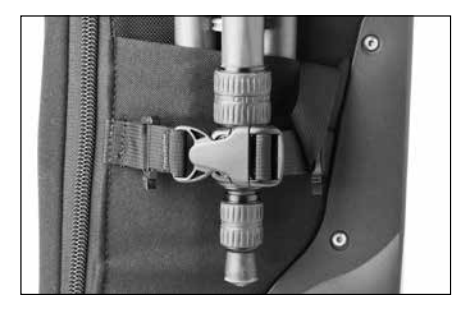
Step 2: Place two tripod legs into the expandable pocket on the side of the bag and use the compression strap to secure the lower portion of the tripod to the side of the bag. Pull the buckle straps on both the Compression Strap and Tripod Strap to tighten the tripod onto the side of the bag.