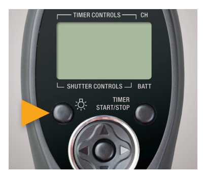
Transmitter backlight button

Both the transmitter and receiver feature a backlight for low light shooting conditions. Press and hold the backlight button for three seconds to activate the backlight on the display. The backlight will remain lit for about six seconds on the transmitter and four seconds on the receiver.