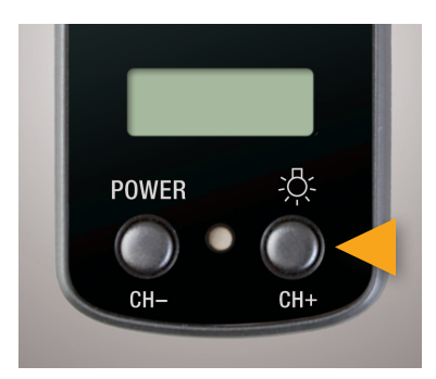
Receiver backlight button