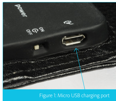
Figure 1: Micro USB charging port