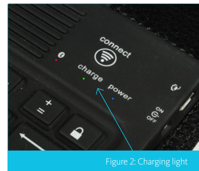
Figure 2: Charging light