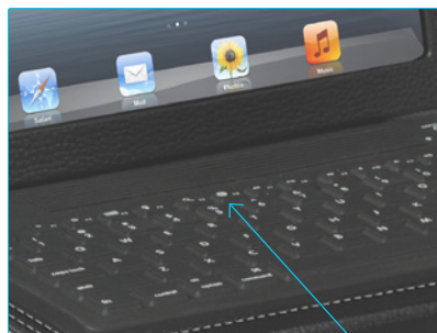
Figure 6: Shortcut Keys

The shortcut keys are shortcuts to various functions on your iPad. They are located in the top row, directly above the number keys. (Figure 6)